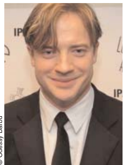
Music Photography award winner William Claxton