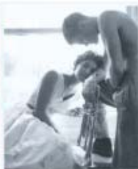
International Photography Awards, 2003. ©2003/2004 Camera Journalists Photo Management. www.internationalphoto.com

© 2003/2004 International Photography Awards